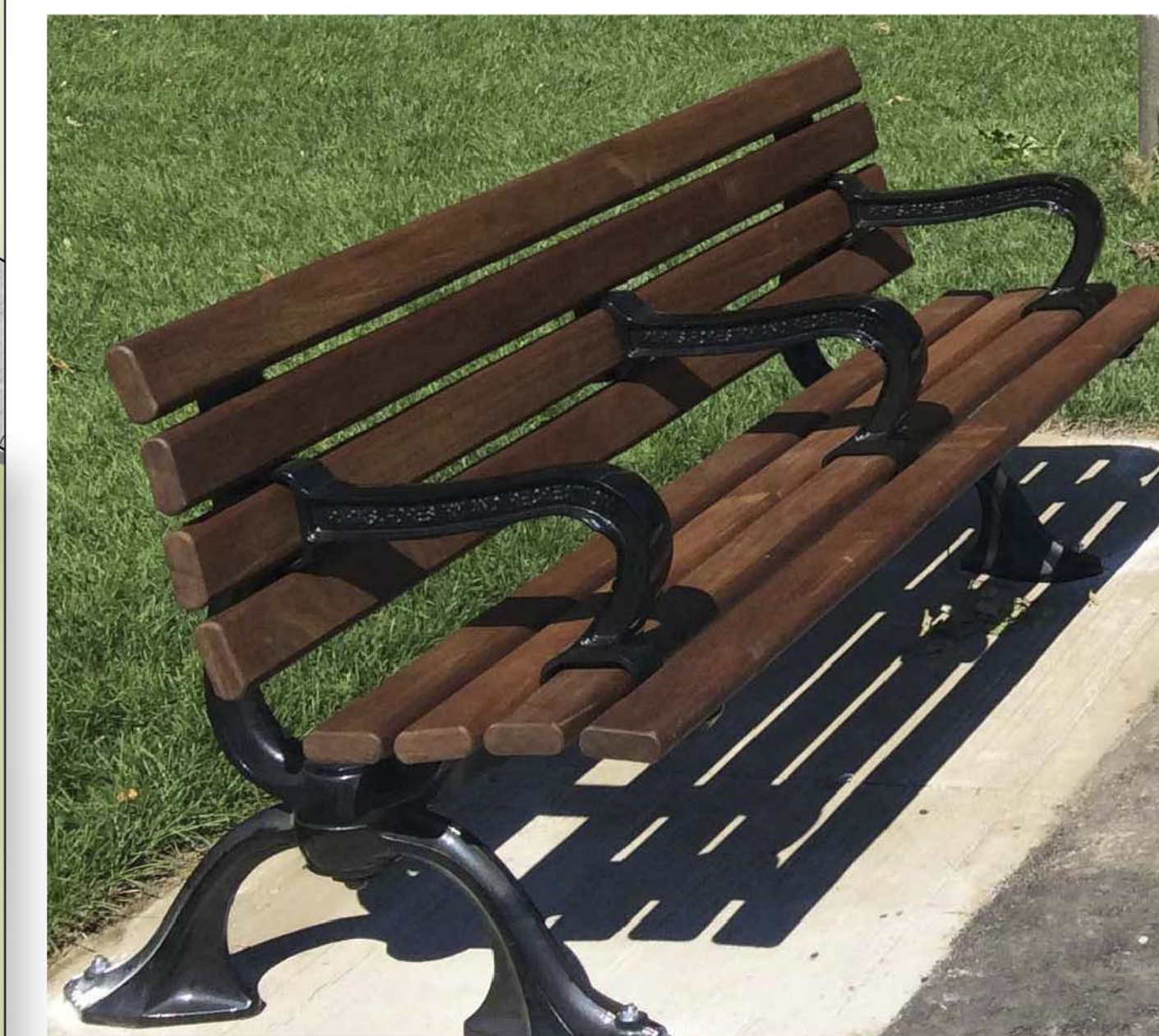
RIVERSIDE BENCH c/w CENTRE ARM (BLACK METAL FRAME AND IPE WOOD SLATS)