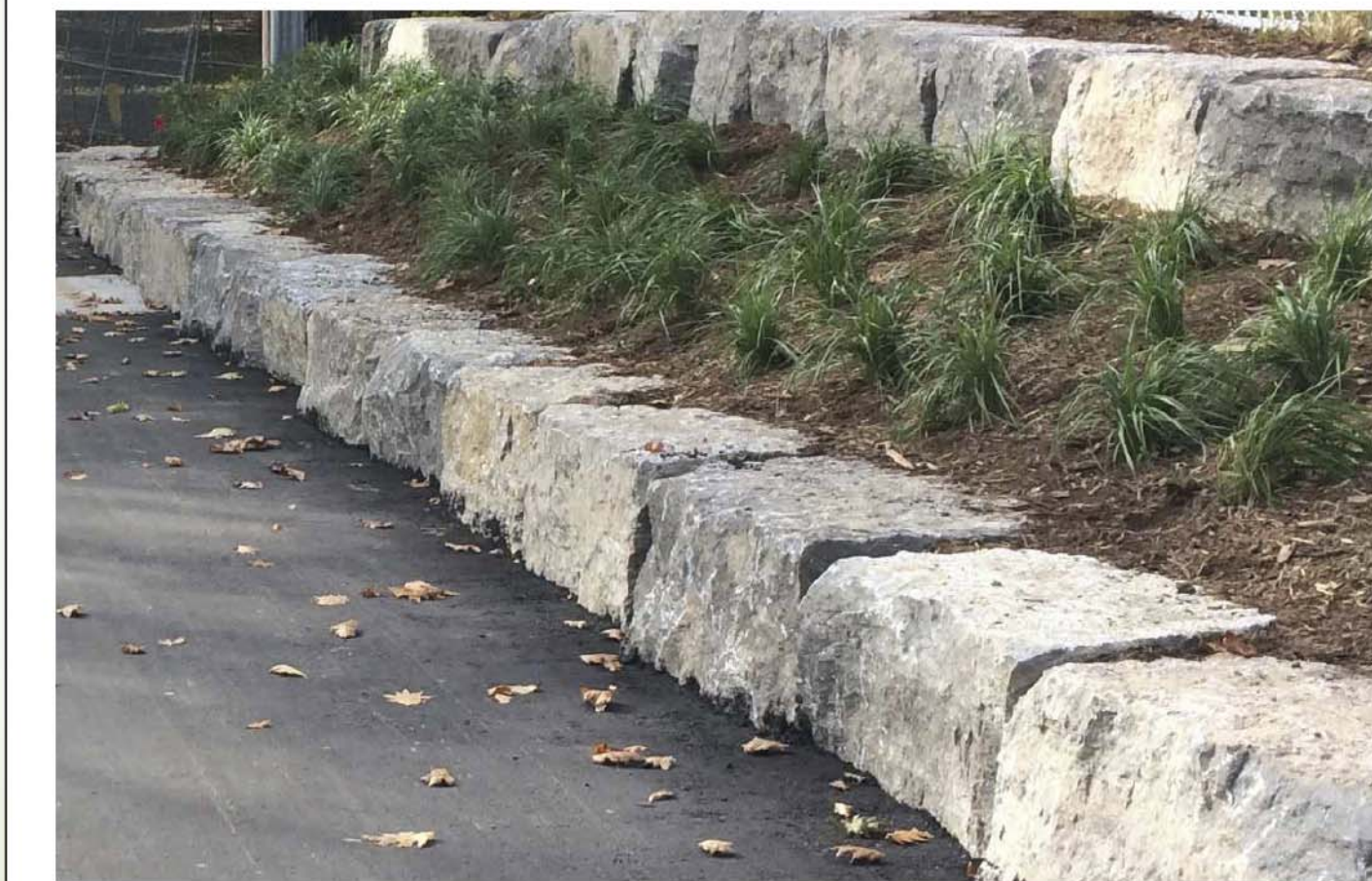
ARMOURSTONE SEAT WALL